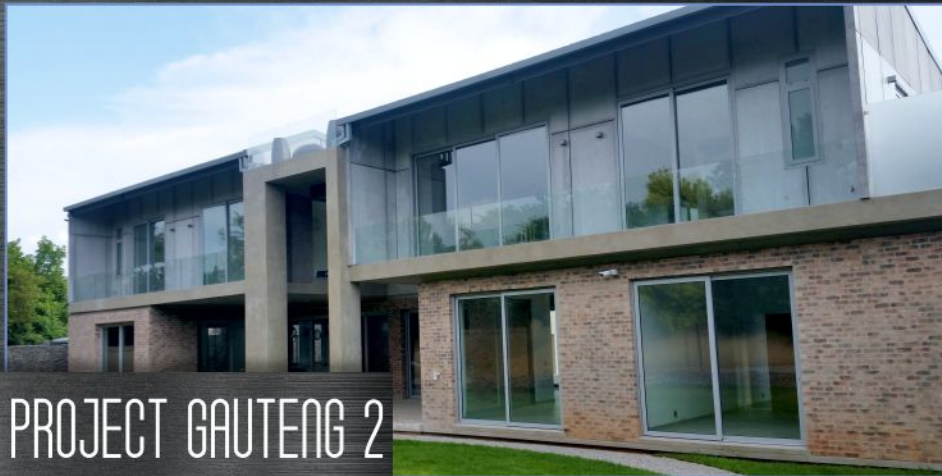
PROJECT GAUTENG 2