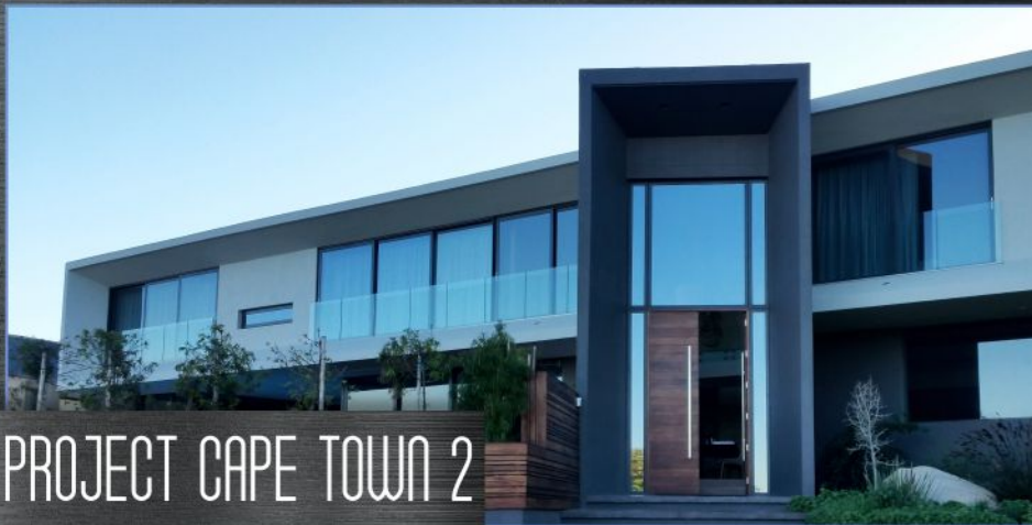
PROJECT CAPE TOWN 2