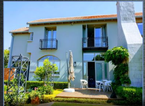
PROJECT PRETORIA 1