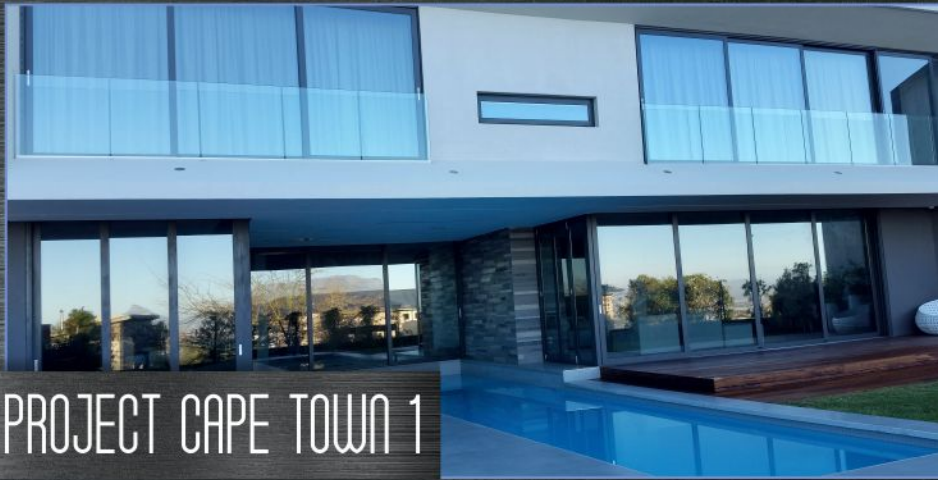
PROJECT CAPE TOWN 1