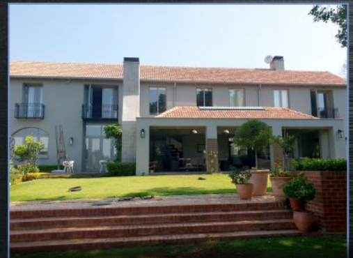
PROJECT PRETORIA 2