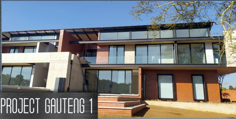
PROJECT GAUTENG 1