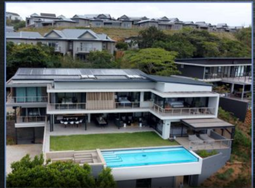
PROJECT KZN 2