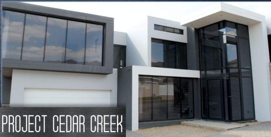
PROJECT CEDAR CREEK