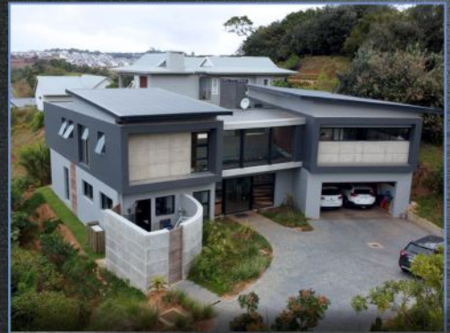
PROJECT KZN 1